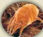
Electron micrograph of the ear mite – Otodectes cynotis